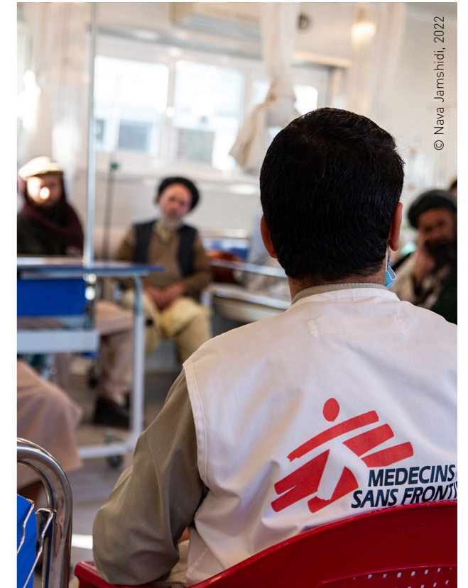
An MSF staff member gives a morning briefing to patients in MSF's male inpatient department in the Kunduz Trauma Centre in Afghanistan.

As such, the main obstacle to accessing healthcare is still the cost, according to 87.5 percent of our survey-respondents, an increase of 18 percent in comparison to 2021 survey's findings. Understandably, people still refer to conflict, security and violence as ongoing challenges. This is, in part, because the survey actively asked information about the preceding 12-month period, but also because for most Afghans, the consequences of living through decades of war will continue to impact their lives for an indefinite period, including their perceptions of barriers to accessing healthcare.