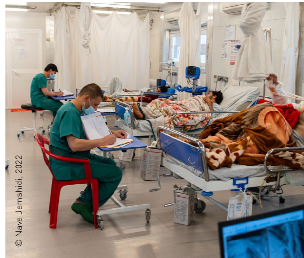
The ICU (intensive care unit) in MSF’s Kunduz Trauma Centre, Kunduz Province, Afghanistan.

More than one third of survey respondents who visited the health facility nearest to their house were not satisfied with the services. The most common reasons cited were lack of medications, being asked to pay high amounts for medication, and being asked to buy the medication privately. People also expressed a lack of trust in the quality of services provided to patients and caretakers, and they perceived public hospital staff as lacking experience and professionalism. People who live in the districts and rural areas, far away from the centre of the provinces, are often left with no other option but to undertake a long and expensive journey to find free, quality medical care. But many people cannot afford to pay the transportation costs, and are forced to borrow money, which is an additional burden for those already suffering from lack of healthcare.